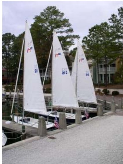
Hilton Head Island, South Carolina